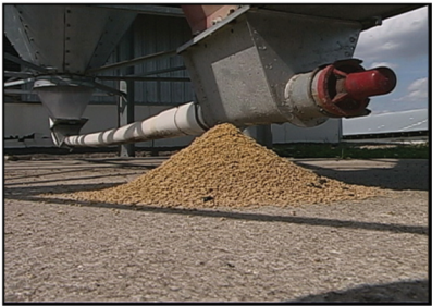
Eliminate all spilled feed