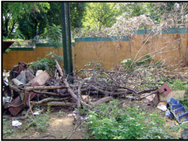
Remove debris from around buildings