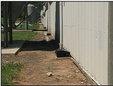
Keep a 1m sterile zone around buildings mowed or sprayed