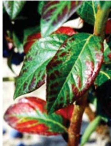
Mg Deficiency in Blueberry