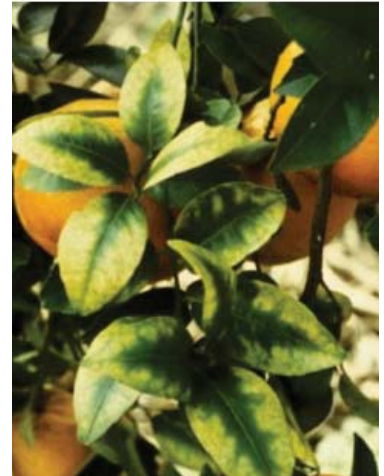
Mg Deficiency in Citrus