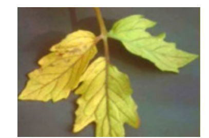
N Deficiency Tomato

Nutrafeed 4 is a soluble crystalline blend formulated for fertigation (application through irrigation water) or foliar application. Fertigation provides maximum root uptake of the applied nutrients particularly when fed through trickle irrigation. Application through trickle enables the nutrients to be placed in the area of the most intensive root activity. Foliar fertilisation is not a substitute for soil fertilisation, but a supplement to it. Nutrafeed 4 is a completely soluble and chloride free formulation, providing a complete range of nutrients necessary for optimal plant growth. NutraFeed 4 is a well balanced NPK soluble fertiliser blend with good levels of nitrogen, phosphorus, potassium, magnesium and trace elements for general growth and is suitable for a wide range of horticultural or broad acre crops at any growth stage