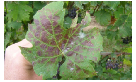
K Deficiency in Grape Vine