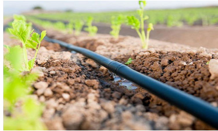
Maintains Irrigation Pressure Uniformity