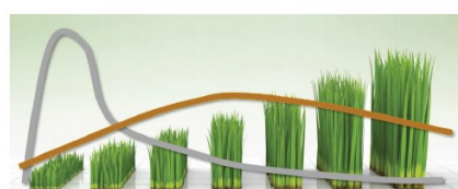
■ Ferticote Blends ■ Standard Fertiliser Blends