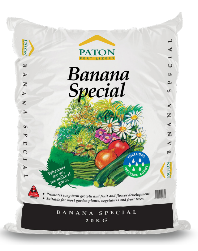
Pack Sizes Available in 20kg bags