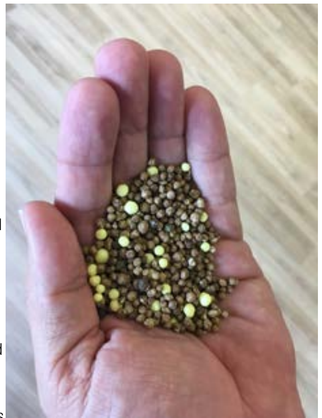
Barmac can individually customise blends of fertilisers and soil health and conditioning products.

Mr Ramsey said Barmac had a reputation for controlled-release fertilisers to better match crop demands – with traditional fertiliser components providing an upfront kick start for a few weeks, and controlled-release components continuing to release nutrients for several months.