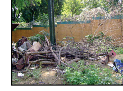
Keep a 1m sterile zone around buildings mowed or sprayed