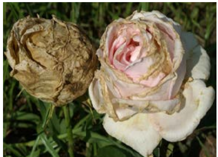
Botrytis in Roses