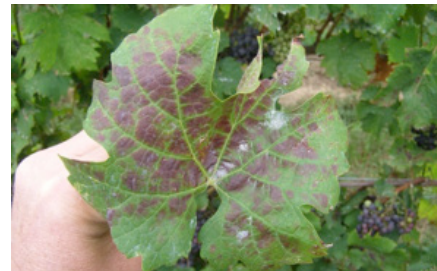
K Deficiency in Grape Vine