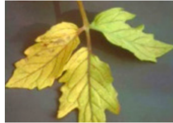
N Deficiency Tomato

Nutrafeed 4 is a soluble crystalline blend formulated for fertigation (application through irrigation water) or foliar application. Fertigation provides maximum root uptake of the applied nutrients particularly when fed through trickle irrigation. Application through trickle enables the nutrients to be placed in the area of the most intensive root activity. Foliar fertilisation is not a substitute for soil fertilisation, but a supplement to it. Nutrafeed 4 is a completely soluble and chloride free formulation, providing a complete range of nutrients necessary for optimal plant growth. NutraFeed 4 is a well balanced NPK soluble fertiliser blend with good levels of nitrogen, phosphorus, potassium, magnesium and trace elements for general growth and is suitable for a wide range of horticultural or broad acre crops at any growth stage