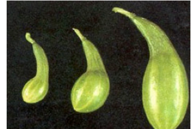
K Deficiency in Cucumber