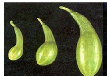
K Deficiency in Cucumber