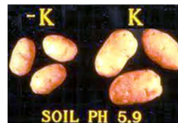
K Deficiency in Potato