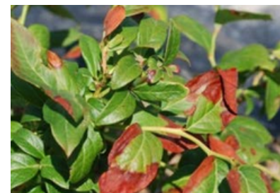
Water stressed blueberry