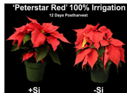
Silica enhanced poinsettia shelf life