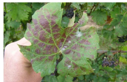
K Deficiency in Grape Vine