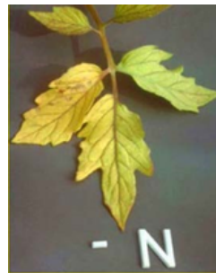
N Deficiency in Tomato