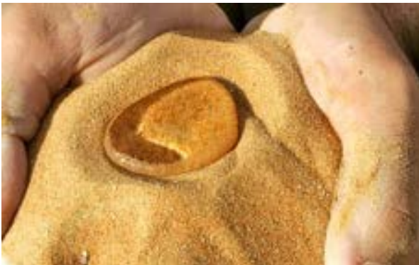
Hydrophobic soil / sand