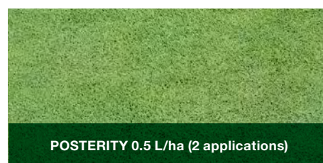
POSTERITY 0.5 L/ha (2 applications)